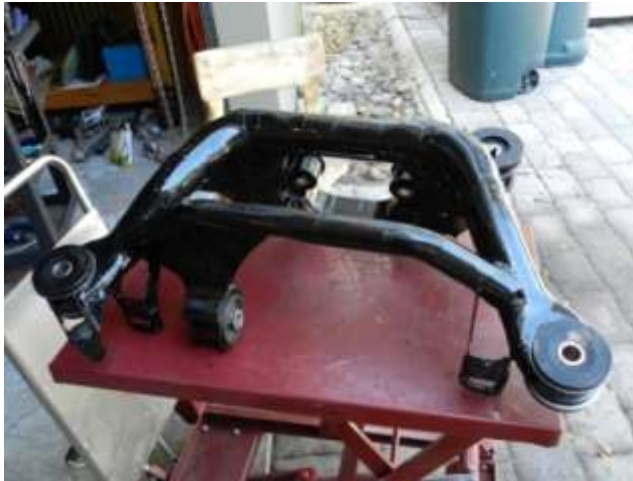
Figure 3 Shiny “new” rear diff carrier